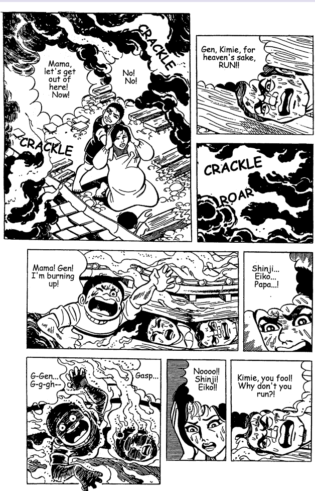
Barefoot Gen Vol.1 : A Cartoon Story of Hiroshima, P272 (Last Gasp of San Francisco, 2004)